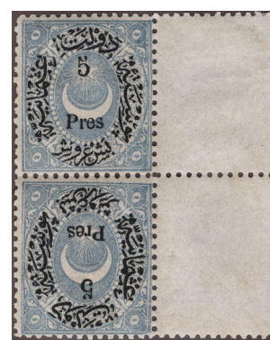
Fig. 2: Vertical pair with inverted overprint (field pos. 40).