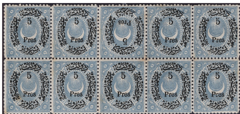
Fig. 1: Block-of-ten (5×2) with one stamp featuring the inverted overprint (field pos. 63).

The 5 piastres stamp with inverted overprint is very rare and is only known to exist unused. Based on the positioning within the sheet of the known stamps, a maximum of 3 sheets may have existed. The field positions in the sheet of 150 stamps are identified as 31–40 (a complete horizontal row) and field position 63 (single stamp within a row). All these are documented below.